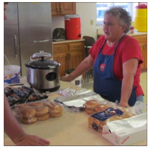
Food prices subject to change without notice.